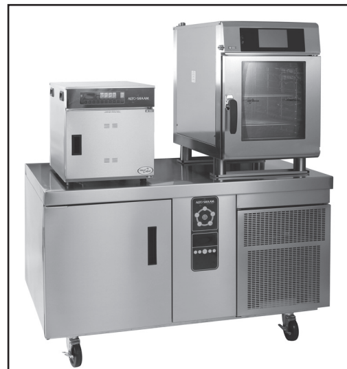
Stacking Kit, QC2-20 without backsplash 5015781