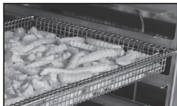
Fry Basket BS-26730