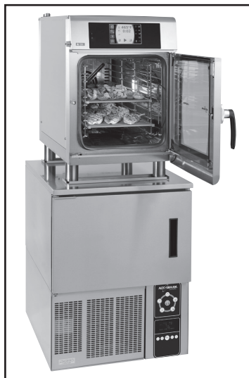
Stacking Kit, QC2-3 5015781