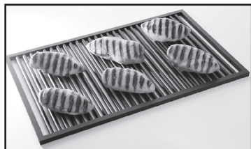
Grilling Grate SH-26731